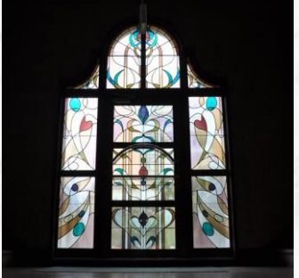
Stained glass door