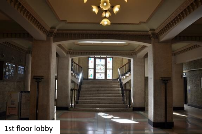
1st floor lobby