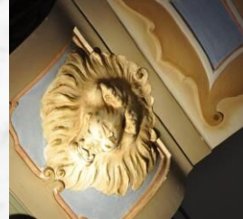
Assembly hall ceiling