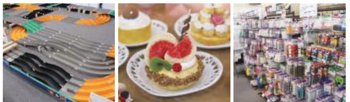
Permanent course for Mini 4WD Workshop Official shop

Shizuoka Hobby Square is equipped with its own Mini 4WD race track, and regularly hosts workshops on making model sweets, a popular hobby for women. Check our homepage if you're interested!