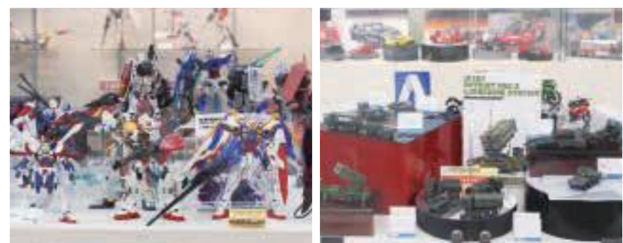
Products on display from six Shizuoka model manufacturers: Aoshima Bunka Kyozaisha, EBBRO, WoodyJOE, TAMIYA, Hasegawa, and BANDAI SPIRITS.