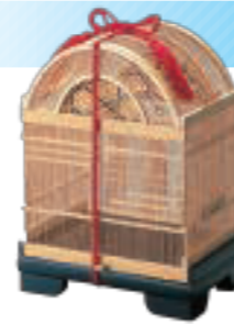
Suruga Takesensuji Bamboo Works