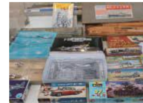
Early plastic models

The current model manufacturers used skill, passion and dedication to rise up during these turbulent times. This is why we can supply products loved all over to markets around the world.