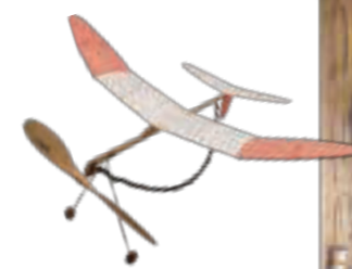
Early wooden model airplanes