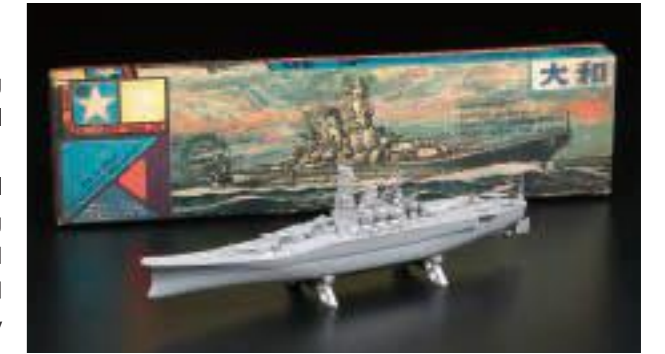
The maiden plastic model of Tamiya, the "1/800 Scale Battleship Yamato" (1960)

When foreign plastic models started being imported in the late 1950s, the model trend shifted from wooden to plastic. Changing material from wood to plastic will have a major impact on the manufacturing process. Human resources, knowledge and money for work such as mold making and handling of plastic resin are also newly required.