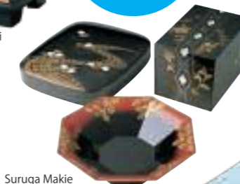
Suruga Makie Gold-relief Lacquerware